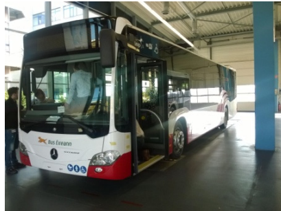
Single Deck Buses