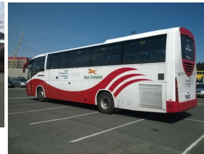
Single Deck Coaches