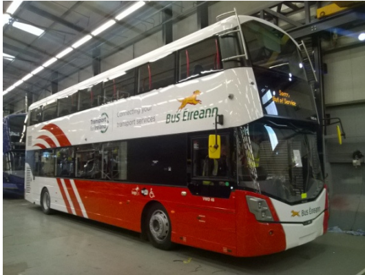
Double Deck Buses