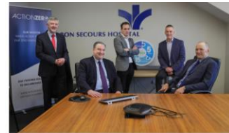
ActionZero partners with Bon Secours Health System in group wide deal to reduce carbon emissions

€15M Partnership with Kepak Group to roll out EscoPod HP across group sites in IRL & UK