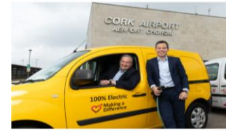
ACTIONZERO AND CORK AIRPORT PARTNERSHIP SAVES ALMOST €4 MILLION IN ENERGY COSTS

Establishment of Manufacturing & R&D Facility with investment