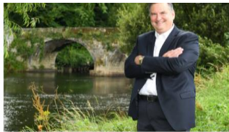
ActionZero to create 80 new jobs

Creating highly skilled climate action jobs in the Cork and Kerry region.