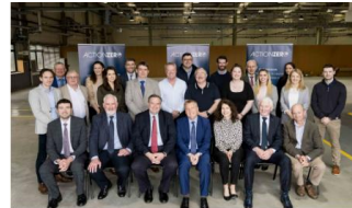
ActionZero establishes manufacturing and research development centre in Tralee

Partnership with Bon Secours Group to roll out EscoPod HP across group sites in IRL 5m across 6 locations