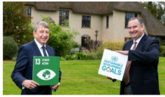
Action Zero announces key partnership with Kepak in €15m strategic energy solutions deal

Merger of Straightline Energy Solutions & Energy Services to become ActionZero